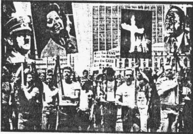
Gertrude Stein Philatelic Society